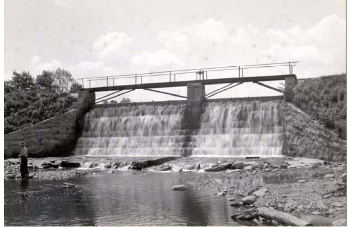
Spillway on July 2, 1937.