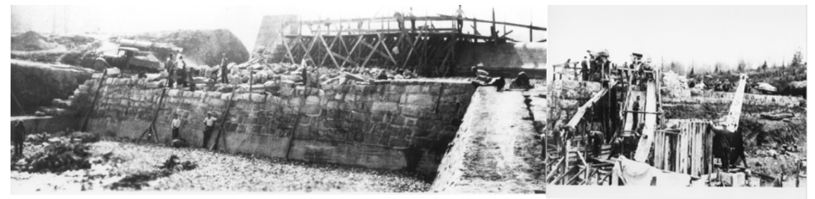
Pouring the weir – 1938

The decision was made to completely reconstruct the dam and the work began in early 1938. A new spillway was placed adjacent to the old emergency spillway in the form of a 110' weir that took two days to pour. This work was being done by Company 331, S-116 and yet another company out of camp S-118, Company 2340. The emergency spillway was beefed up in 1938 and the overall height of the breast was raised