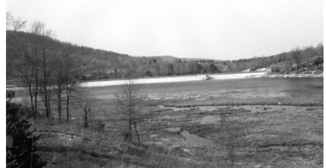
Parker Lake refilling during the winter of 1939 – '40.

considerably. A new sluice gate was built at the location of the old original spillway in 1939 and rip rap was laid on the breastwork during the summer of the same. Most of the work was completed by October of '39 and the gate was closed to re-fill the lake.