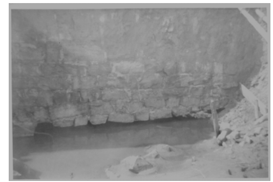
Water under the masonry core.

The dam was repaired through the efforts of the men and boys of camps S-116 and S-118 (Camp S-73 was now closed). The official opening of the park was scheduled for summer of 1937, and a beach and bathhouse had yet to be built. Company 5470 (Company 1380 had moved on), camp S-118 had the task of building a swimming beach and a bathhouse that had showers, sand baths, lavatories and foot baths. The swing piers (large L-shaped piers) were also constructed as part of the project. All was ready by 4<sup>th</sup> of July weekend, 1937 --- the grand opening the Parker Dam State Park.