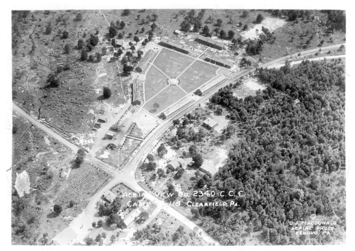
As you travel the many forestry roads in the area be on the lookout for row upon row of evergreen trees, indicating the presence of an old CCC camp. Along McGeorge Road near the site of S-118 is typical of this pattern of planting.

GPS location: N 41° 12.049' W 78° 25.748'