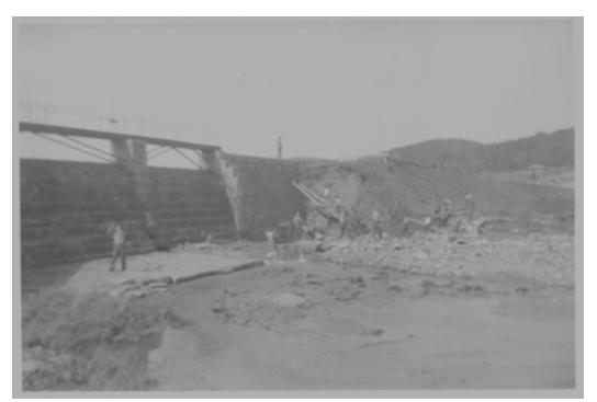
1936 flood damage.

The 1936 flood (end of March) damaged the dam at the spillway – water crested the dam and eroded the earthen embankment on the West side of the spillway, allowing the water to breach under the footer of the masonry core of the dam.