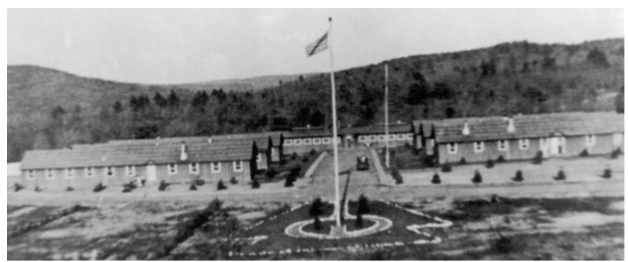
A view from west of the flagpole, 1935.