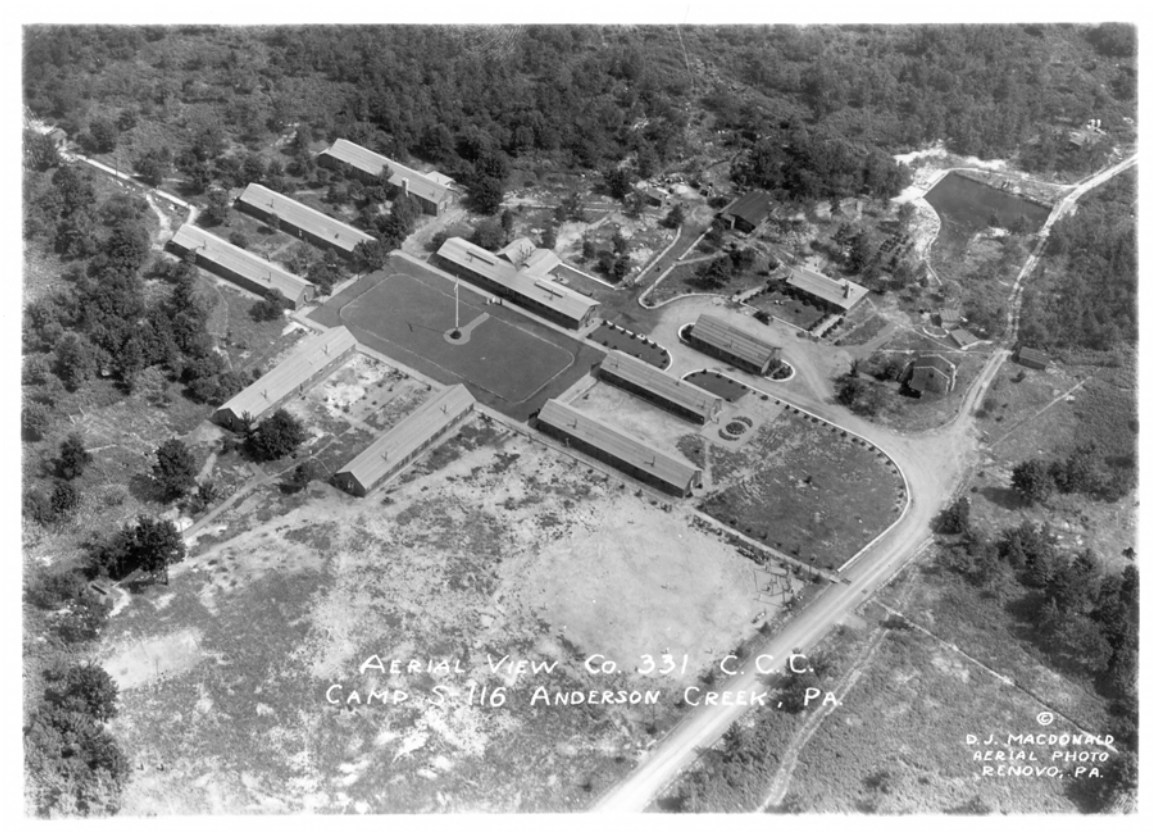
Aerial View of CCC Camp S-116, Anderson Creek, PA. The small pond in the upper right corner of this photo can still be seen along Crystal Springs Road.

S-116, Anderson Creek - Nursery, PA was established on May 30, 1933, on Crystal Springs Road near Four Mile Road. The primary job of S-116, Company 331 was to work in the State Tree Nursery to produce the needed trees for reforestation of this area of the state. William Dague (ran the nursery) took an interest in the project going on at Parker Dam and soon the men of S-116 were working along with those of S-73, building the dam and other construction projects. This camp was closed in 1941. GPS location: N 41°08.077' W 78° 30.842'