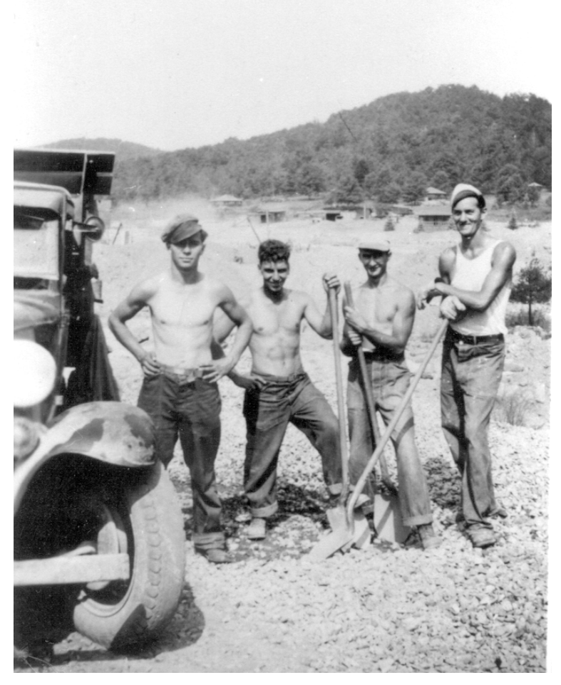
A Few of the Boys of CCC Camp S-118 at Parker Dam.

CCC Camps involved in building this park: