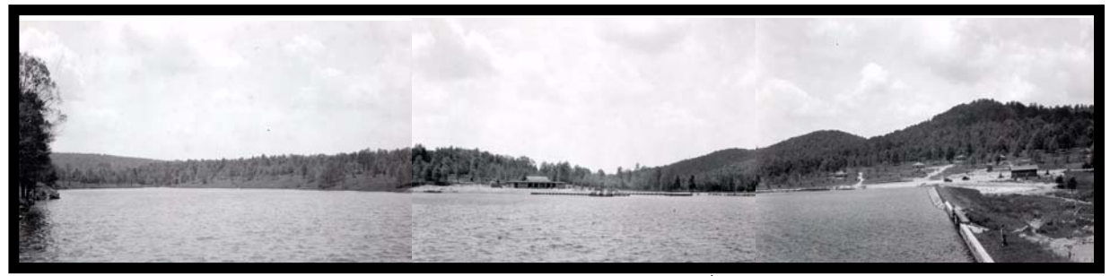
The GRAND Opening of Parker Dam State Park - 4<sup>th</sup> of July weekend, 1937.

The dam was repaired through the efforts of the men and boys of camps S-116 and S-118 (Camp S-73 was now closed). The official opening of the park was scheduled for summer of 1937, and a beach and bathhouse had yet to be built. Company 5470 (Company 1380 had moved on), camp S-118 had the task of building a swimming beach and a bathhouse that had showers, sand baths, lavatories and foot baths. The swing piers (large L-shaped piers) were also constructed as part of the project. All was ready by 4<sup>th</sup> of July weekend, 1937 --- the grand opening the Parker Dam State Park.