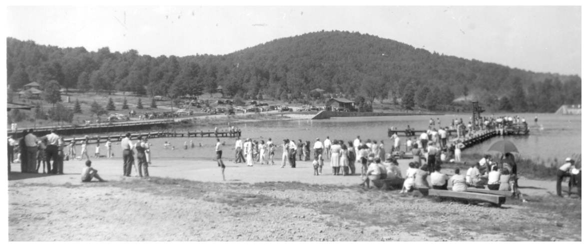
Parker Dam State Park - 1940.

By the spring of 1940 the lake was once again ready for visitors. The CCC camps supplied lifeguards for the swimming season – two guards per day. The camps closed shortly after WWII began, but the park continued on, weathering many changes through the years. The character of Parker Dam State Park owes the CCC – nothing built today equals the rugged beauty of what the Civilian Conservation Corps was able to do.