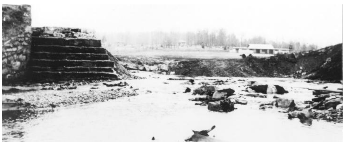
Parker Dam not long after the official opening, 1937.

The dam failed sometime later that fall (probably November) of 1937 and the lake drained.